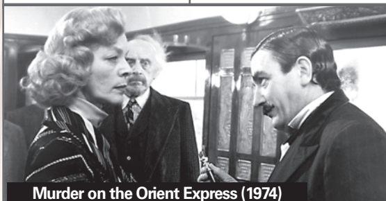
Murder on the Orient Express (1974)