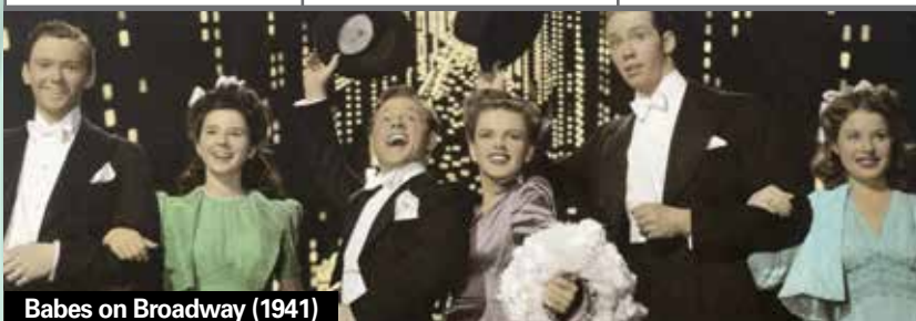
Babes on Broadway (1941)

Thursdays in December It's fitting that Turner Classic Movies will be celebrating an actor born with the name Joseph Yule Jr. during Christmastime. Of course, the millions who have been entertained by the incredible body of work that this man put out during his close to 90-year career know him a lot better by his professional name of Mickey Rooney . Each Thursday this month, the beloved star will be celebrated with daylong marathons of his memorable films, and that still won't even begin to come close to showing the nearly 300 movies in which he appeared. The first lineup (Dec. 5) runs 25 hours and features several films that Rooney made in the 1930s. Dec. 12 features a number of his best remembered films from the late 1930s and 1940s, during which he was consistently among the biggest box office draws, if not the biggest. Dec. 19 features a wide range of titles from the 1950s to '70s, and also some character types and film genres that may seem unexpected for the star but definitely show his acting range. One good example of that is the film noir Quicksand (1950), which finds Rooney playing against type as a garage mechanic who descends into a life of crime. The month concludes with one of his most famous roles as Andy Hardy on Dec. 26 beginning with the first title, 1937's A Family Affair , to the final installment, 1958's Andy Hardy Comes Home .